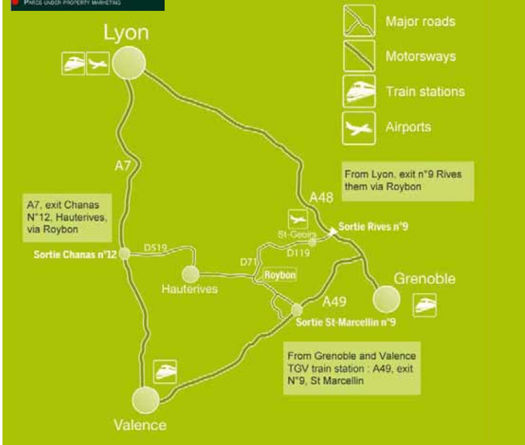
Major cities nearby: Lyon, Valence, Grenoble, Chambéry, Annecy and Geneva.

The Domaine de la Forêt de Chambaran, close to Grenoble, Lyon and Switzerland, is located in Iser, on the edge of the Alps. The Rhone-Alpes region has an excellent infrastructure. TGV, motorways, alpine tunnels, the dense Rhone-Alpes regional train network and airports in Grenoble and Lyon.